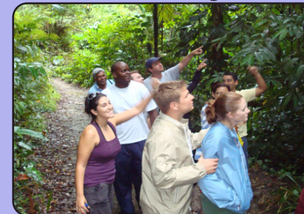
The 'Chenpire' admires Tobago's rainforest.