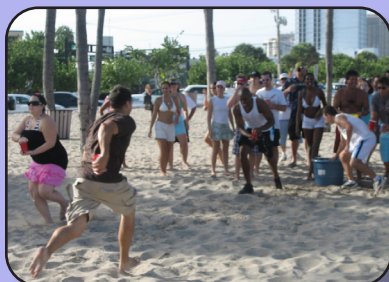
The water bucket race.

On August 2, 2008, Chen and Associates held their 4th Annual Family Picnic at South Beach Park in Fort Lauderdale. Employees and their guests participated in the first annual 'Chen Olympics' which included events such as a three legged race; Beach Ball Balancing Act in which players carried an inflatable beach ball without using their hands; Water Bucket Race; and hoops around the pole, where members of each team join hands in a circle and pass a hula hoop to their neighbor by stepping through it and passing it to without letting go of his/her teammates' hands.