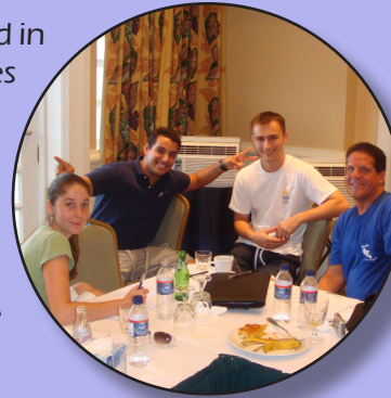
Employees brainstorm about the firm's strengths.

Employees were also treated to an afternoon of visiting Fort King George in Scarborough and the Tobago Rain Forest Reserve; the Reserve, established in the late 18 th century, is the oldest forest reserve in the western hemisphere.