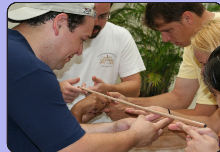
Employees participate in a team building exercise.