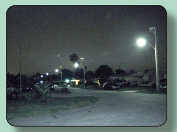
The City of Dania Beach after.