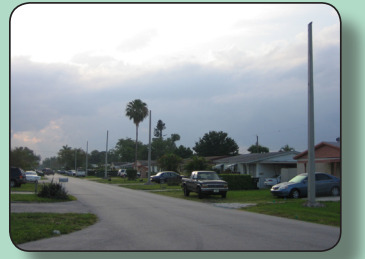
The City of Dania Beach before.

The Emerald Award Program is designed to recognize businesses, government, individuals, or organizations in Broward County demonstrating a commitment to protecting and preserving our environment. The City is also being considered for the Emerald Trophy which will be awarded later this year.