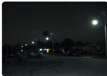
Dania Beach after

In an effort to eliminate dependency on the local electric utility, Chen and Associates designed one of the largest municipal projects involving solar lighting for the City of Dania Beach. The new solar powered lights were installed in a neighborhood bordered by State Road 7 on the west, Southwest 40 th Street on the east, and Griffin and Stirling roads on the north and south. The City of Dania Beach received Community Development Block Grant (CDBG) funds from the U.S. Department of Housing and Urban Development in addition to their own funds.