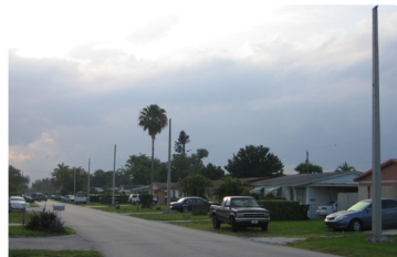
Dania Beach before