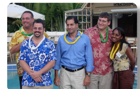
FES Broward 2007 to 2008 Officers at the luau-themed induction.