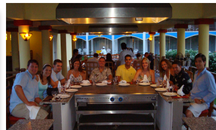
Chen and Associates group dinner at Breezes Resort in Runaway Bay