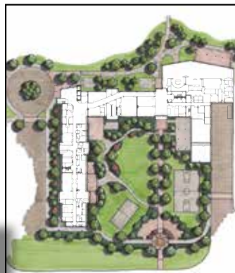
FAU BT-646 Housing Design