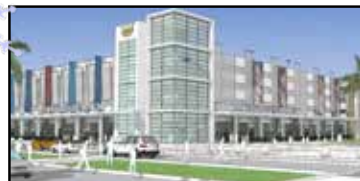
FAU Parking Garage III - BT-698